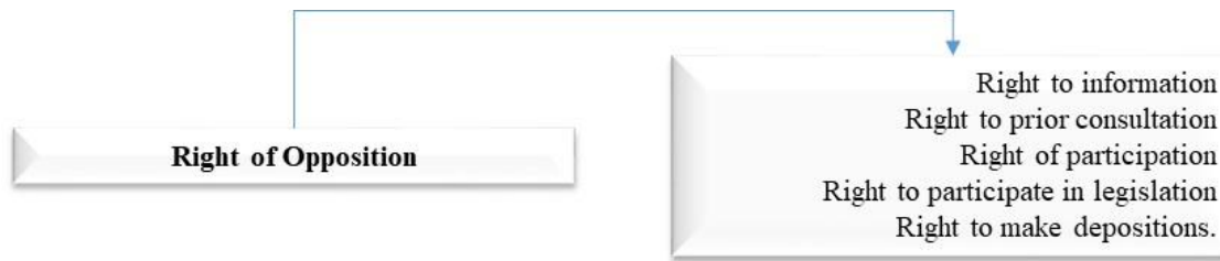
Figure 2: Rights in the Opposition Right Statute