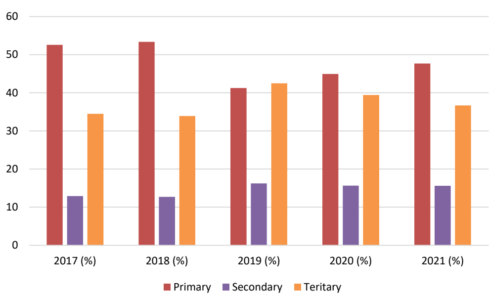
Figure 2. Papua Gross Domestic Regional Bruto