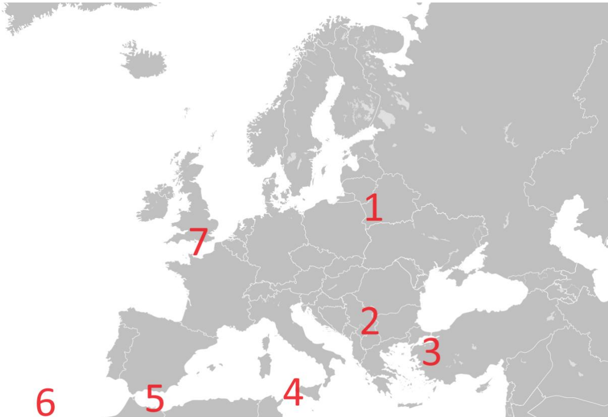
Figure 1: Illegal Immigration to the European Union and the main Routes as of 2022, and 2023.

Note on Illegal Migration Routes to European Union: 1 – Eastern Land Border, 2 – Western Balkan Route, 3 – Eastern Mediterranean, 4 – Central Mediterranean, 5 – Western Mediterranean, 6 – Western African, 7 – The Channel Route